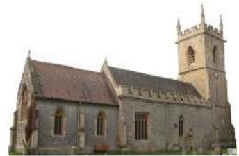
Hinton on the Green